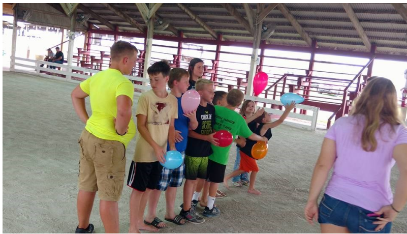
Fun n Games at Jasper Co Fair

Tri-County FFA members helped with several events at the Jasper and White County fairs. At Jasper County, we organized the Young McDonald's building and hosted Fun n Games and a pedal pull. At the White County fair, we helped with the Young McDonald's Farm, hosted a pedal pull, and worked shifts at White County Pork Producers. Thanks to everyone who helped out with the events!