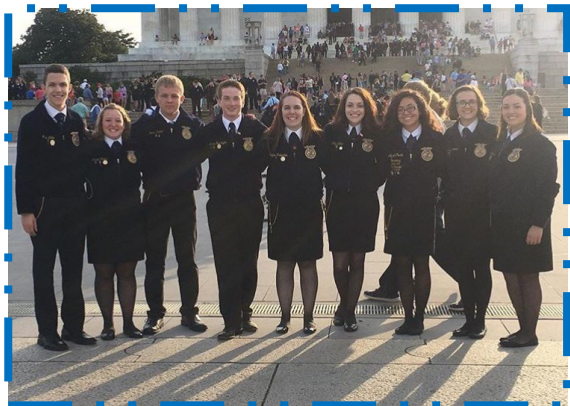
Tri-County FFA members (plus a few friends) at WLC!