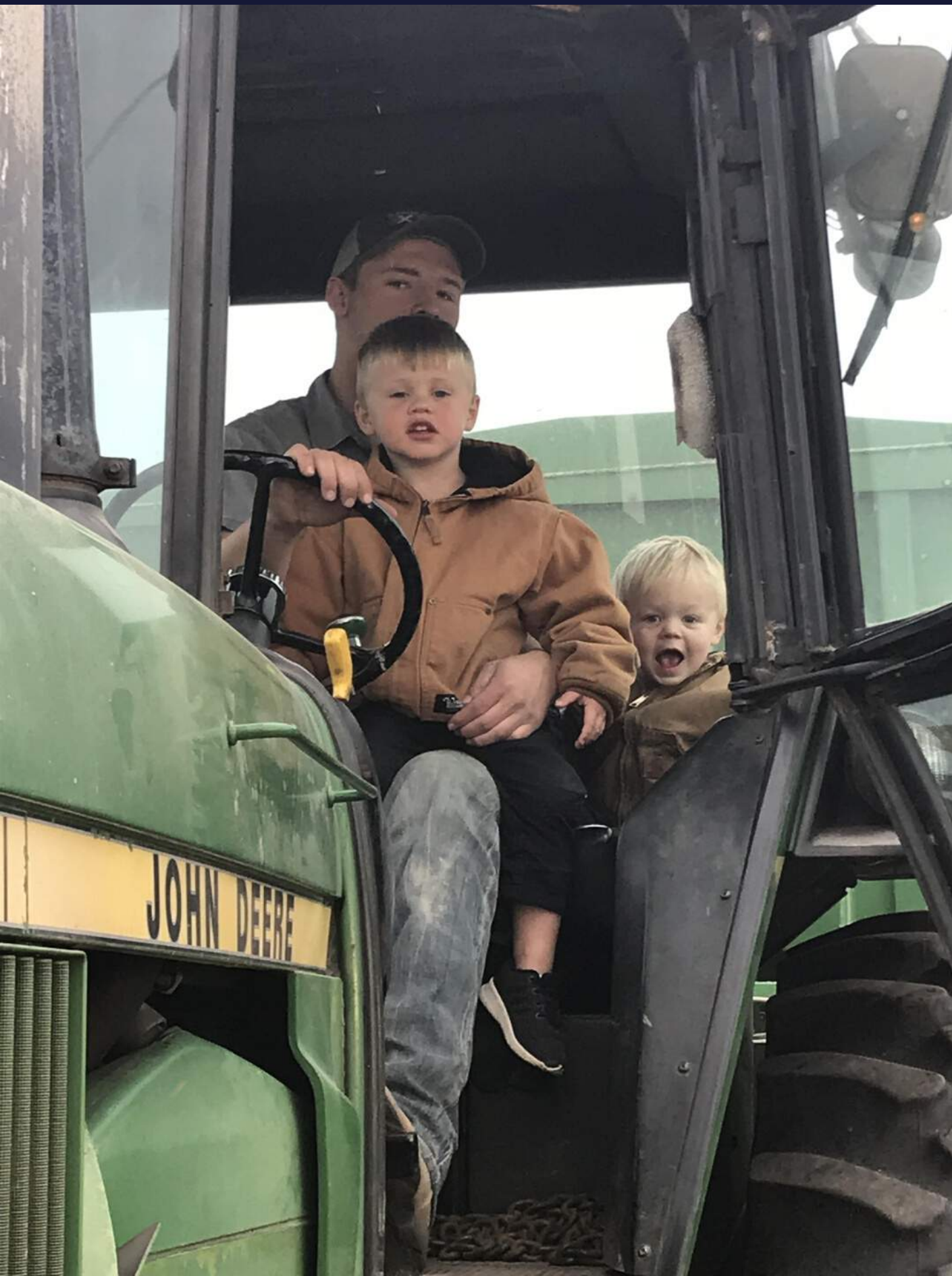
Layton R. Diversified Crop Placement