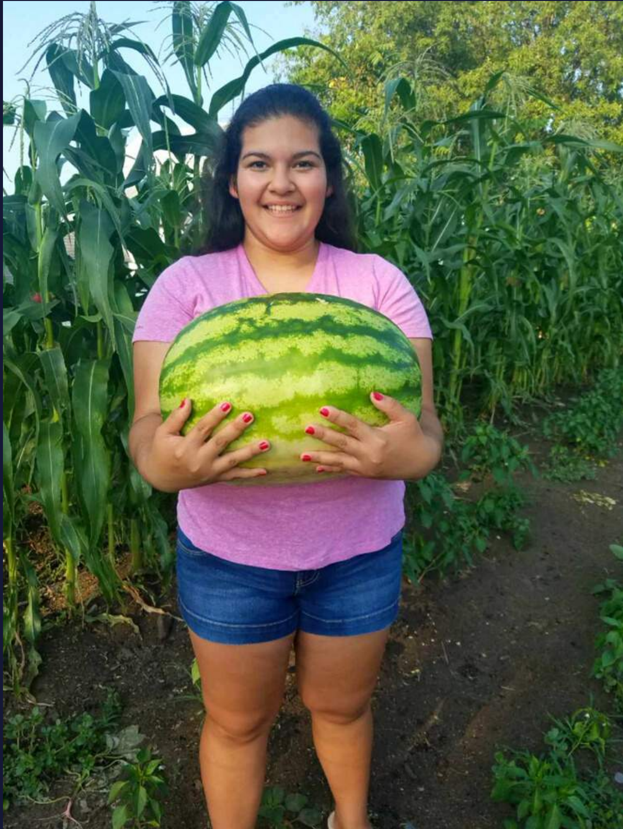
Verania D. Vegetable Production