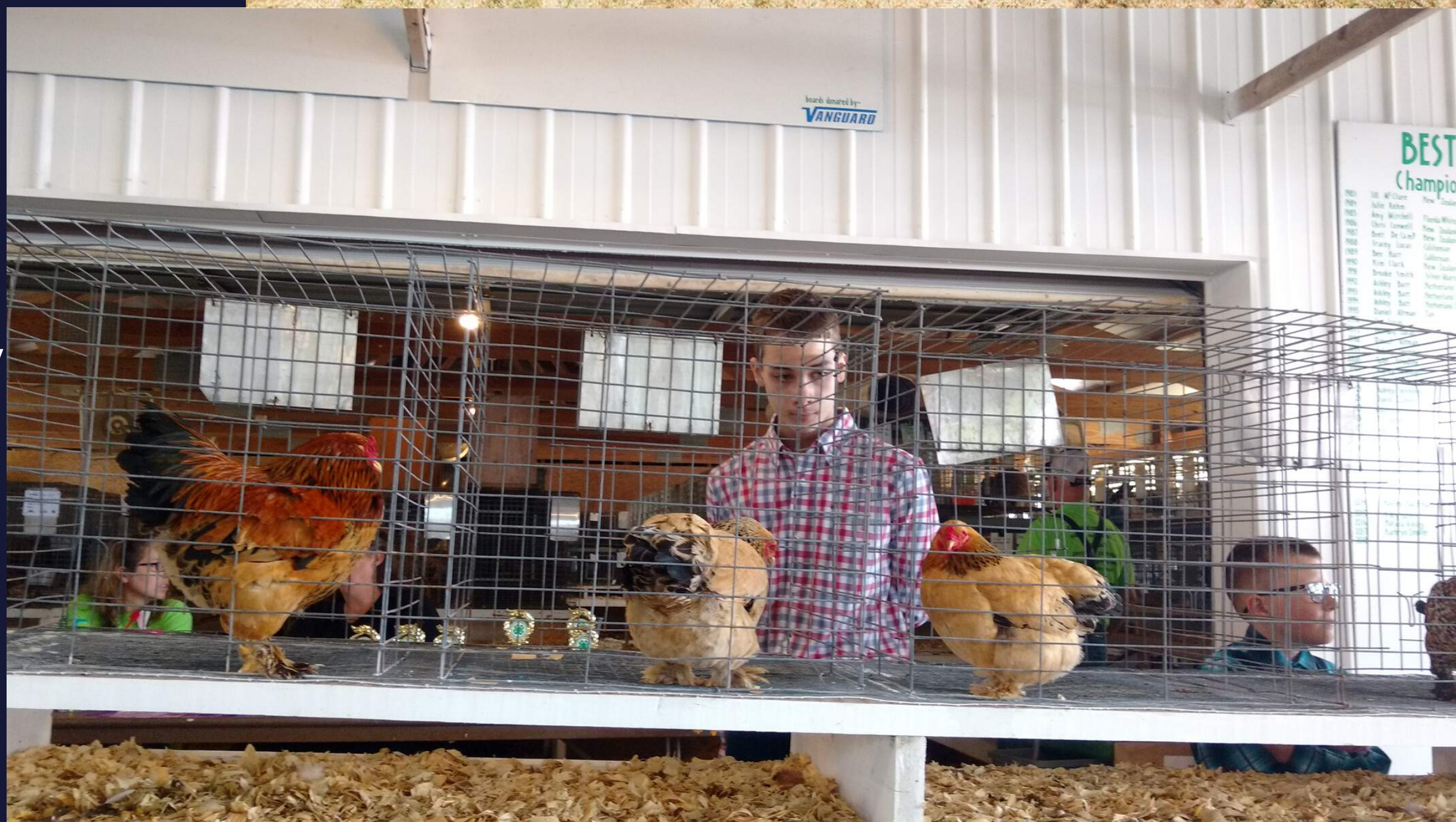
Lucas S. Poultry Production