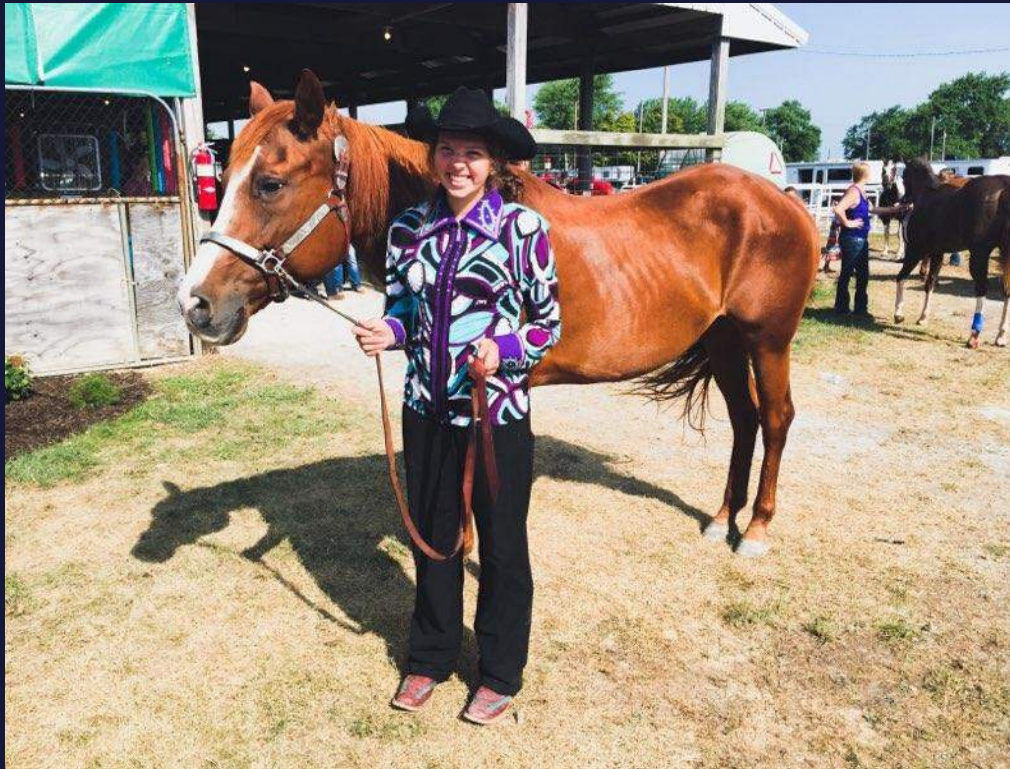
Willa W. Equine Placement